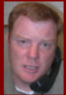
Me on the Phone