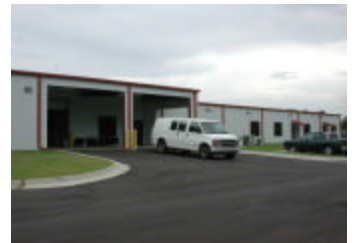
The back of the new building.

We encourage friends and families alike to visit Parker Towing's new address and see our pleasant surroundings first hand.