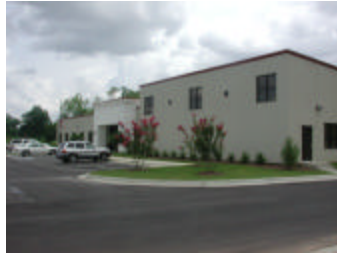
A view of the front of the new building.

After decades of being located along the banks of the Black Warrior River in Tuscaloosa, the Parker Towing Company main office now calls Northport home.