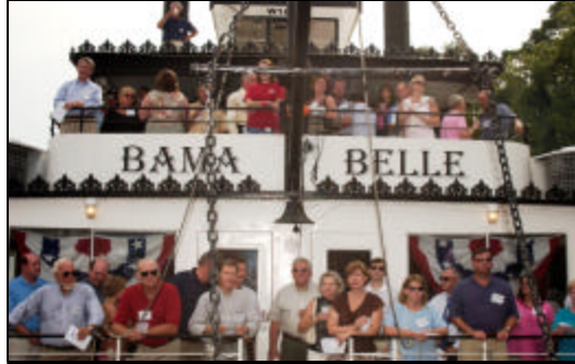
Friends and family gather to watch the christening