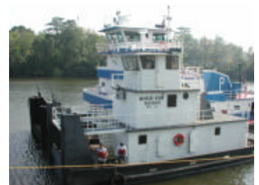
The M/V Miss Kim arrives at the Parker Towing Company dock in Northport, AL.