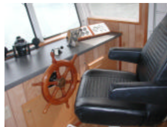
Inside the M/V Miss Kim's wheelhouse