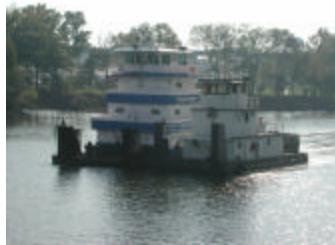
M/V Alison Haun brings the M/V Miss Kim to Northport

The M/V Miss Kim was purchased by Parker Towing Company on October 15, 2004. The motor vessel was built in 1974 and is 55 feet long by 22 feet wide. The M/V Miss Kim is powered by two Detroit 12V71 engines which account for the boat's 800 hp. The gross registered tonnage for the vessel is